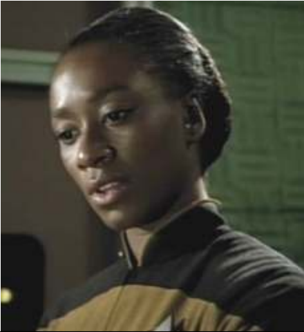
TNG: "Future Imperfect" Ensign Maggie Hubbell, a transporter chief aboard the USS Enterprise-D.