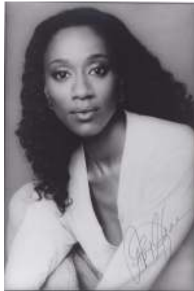
April Grace publicity photo

http://images.wikia.com/memoryalpha/en/images/8/82/Maggie_hubbell.jpg