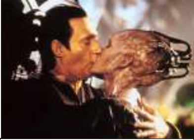
Star Trek “First Contact”: The Borg Queen (Alice Krige) seduces Commander Data (Brent Spiner) with human flesh. http://www.nd.edu/~ljordan/data.text/images/databorg.jpg

Theme 1 - A Pound of Flesh: Flesh as a commodity is explored extensively in the world of Star Trek as well as the science fiction world. In 1973, Soylent Green dealt with the conversion of dead humans into palatable protein crackers to feed the people in a futuristic overpopulated Earth giving pause to the question “are we more valuable dead?”