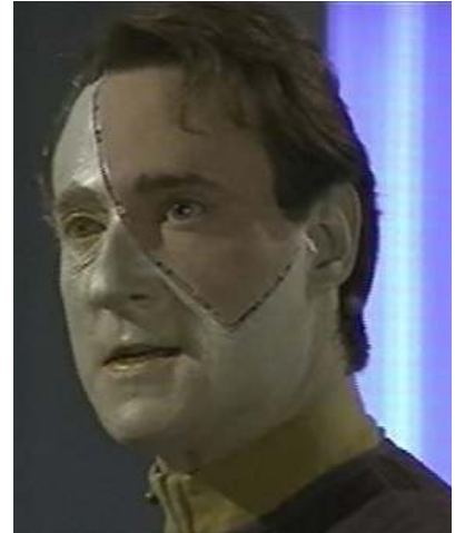
Star Trek “First Contact”: Commander Data (Brent Spiner) with human flesh grafted to his cybernetic body. www.trekconnection.com/pictures/ST_8/pictures/other/st8_08052001173523.jpg

Star Trek explores the dehumanization of humankind through the species known as the Borg. When killed, the Borg are recuperated and, if they cannot be resuscitated, their parts, both flesh and cybernetic, are reused to sustain the Borg collective. In the Star Trek “First Contact”, Commander Data is tempted by flesh. Held captive, the Borg Queen attempts to seduce Commander Data with real flesh instead of his synthetic flesh if he agrees to betray Enterprise.