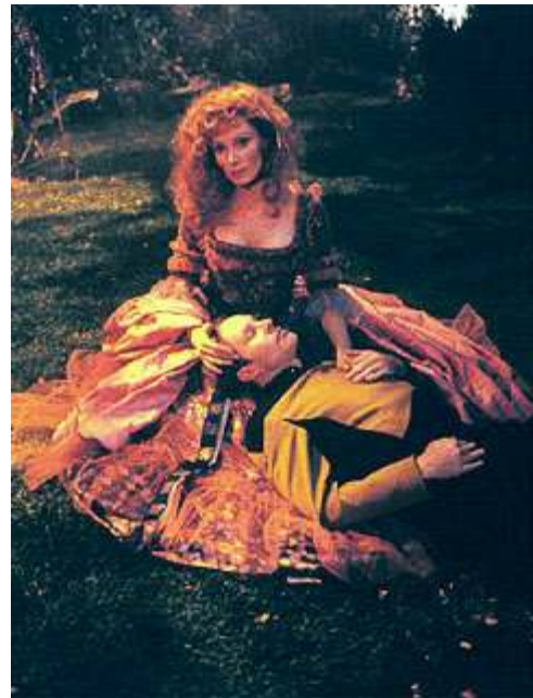
TNG: "Hollow Pursuits" Dwight Schultz as Lt. Reginald Barclay and Gates McFadden as Dr. Beverly Crusher in a holodeck programme. www.startrek.com/imageuploads/200303/tng-169-beverly-crusher--barcl/240x320.jpg

heme 2 - "Body Parts" OK. This is too delicious an irony. In an Deep Space Nine episode entitled "Body Parts", Quark, a Ferengi barkeep aboard the spacestation played by none other than Armin Shimmerman (Judge Hooper in this episode of BL) , returns from a visit to Ferenginar where he was misdiagnosed with a rare and fatal disease. As Ferengi must pay off their debts before death, Quark decides to put up his remains for bidding on the Ferengi Futures Exchange to earn the needed latinum, the currency of the future.