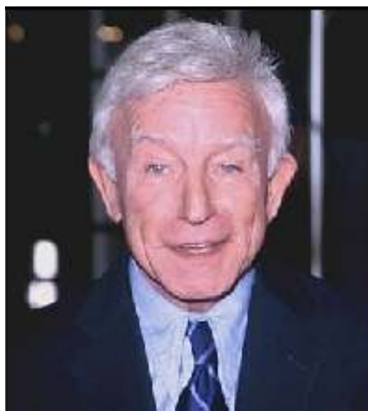
Henry Gibson http://images.hollywood.com/images/4_369250.jpg