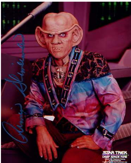
DS9/TNG: Armin Shimerman as regular cast member, Quark, a Ferengi bartender

Star Trek Alumni: William Shatner (Denny Crane), René Auberjonois (Paul Lewiston), Armin Shimerman (Judge Brian Hooper), Henry Gibson (Judge Clark Brown)