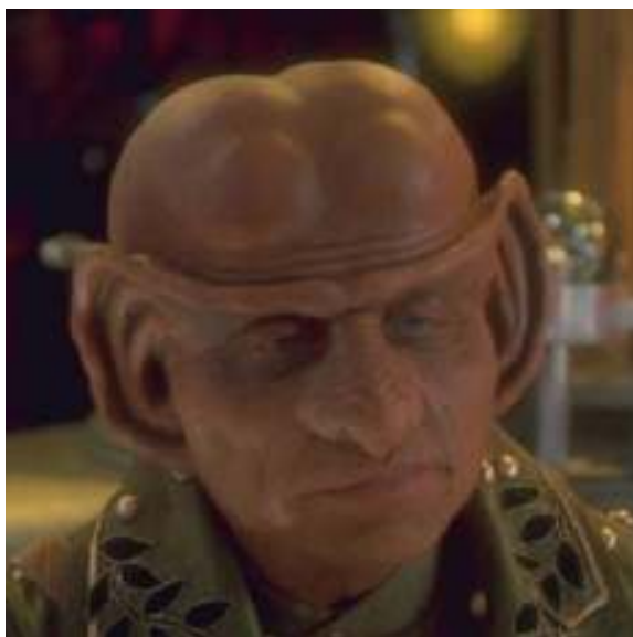
DS9: Henry Gibson in his recurring role as the Ferengi "Nilva"