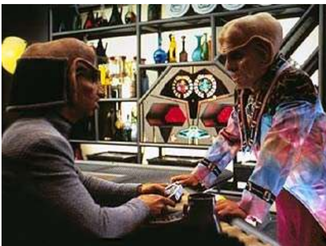
DS9: "Body Parts" Quark (Armin Shimmerman) advised his brother Rom (Max Grodenchik) that he has "settled his affairs" www.startrek.com/imageuploads/200306/ds9-497-quark-faces-an-

Quark accepts a huge anonymous bid of 500 bars of latinum, which he immediately accepts, happy to die a winner. However, Quark learns from his doctor that he isn't going to die after all.