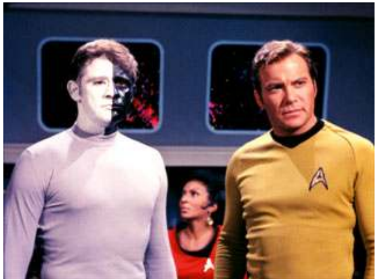
TOS: Lokai (Lou Antonio) and Captain James T. Kirk (William Shatner) in "Let That Be Your Last Battlefield"

www.dga.org/news/v26_2/images/Lou Antonio.jpg