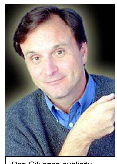
Dan Gilvezan publicity photo <a href="http://www.dangilvezan.com/Pages/television.html">http://www.dangilvezan.com/Pages/television.html</a>