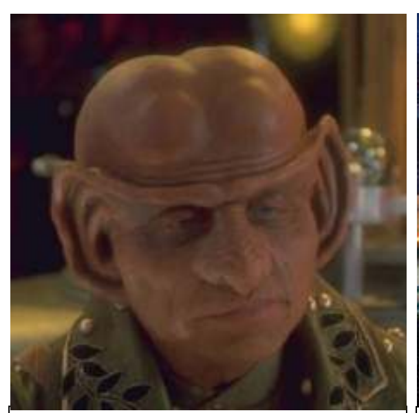
TNG: "Profit and Lace" Henry Gibson portrays the Ferengi, Nilva <a href="http://images.wikia.com/memoryalpha/en/images/b/bd/Nilva.jpg">http://images.wikia.com/memoryalpha/en/images/b/bd/Nilva.jpg</a>