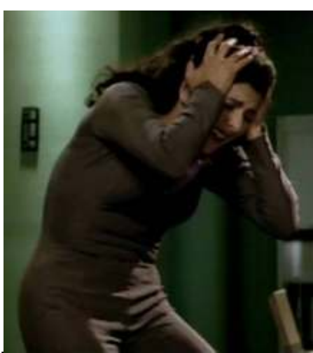
TNG "The Loss" Counselor Deana Troi (Marina Sirtis) is tormented by the loss of her telepathic abilities. http://images.wikia.com/memoryalpha/en/i mages/4/43/The_loss.jpg