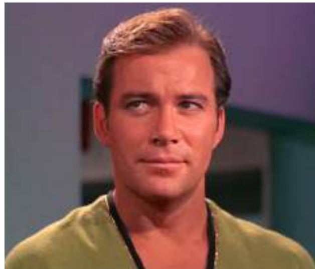
TOS: "Mirror Mirror" Mirror Kirk http://tos.trekcore.com/gallery/albums/2x10/Journey_to_Babel_356.JPG