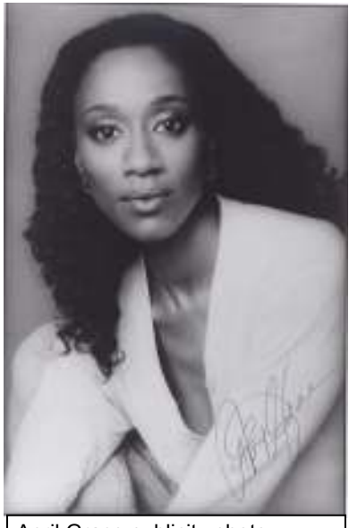
April Grace publicity photo http://ia.imdb.com/media/imdb/01/I/35 /44/60/10f.jpg