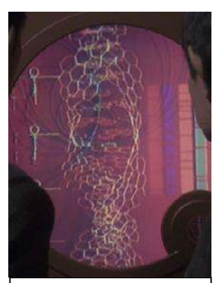
ENT: "Stigma" "Vulcan DNA (T'Pol) with clear Pa'nar Syndrome. http://images.wikia.com/me moryalpha/en/images/a/a5/ Vulcan DNA schematic.jpg