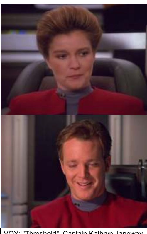
VOY: "Threshold" Captain Kathryn Janeway (top), Lt. Tom Paris (bottom) <u>http://voy.trekcore.com/gallery/albums/2x15/threshold 125.jpg</u> <u>http://voy.trekcore.com/gallery/albums/2x15/threshold_106.jpg</u>

http://voy.trekcore.com/gallery/albums/2x15/threshold_468.jpg