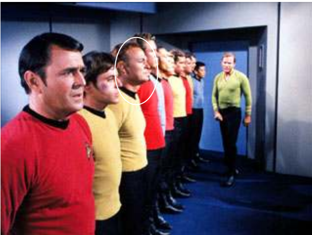
TOS: "Trouble with Tribbles" Captain Kirk dresses down his crew for a bar room brawl with the Klingons in this screencap from the original sixties era episode. http://images.wikia.com/memoryalpha/en/images/1/17/Kirk_Bas_hir_and_Obrien.jpg