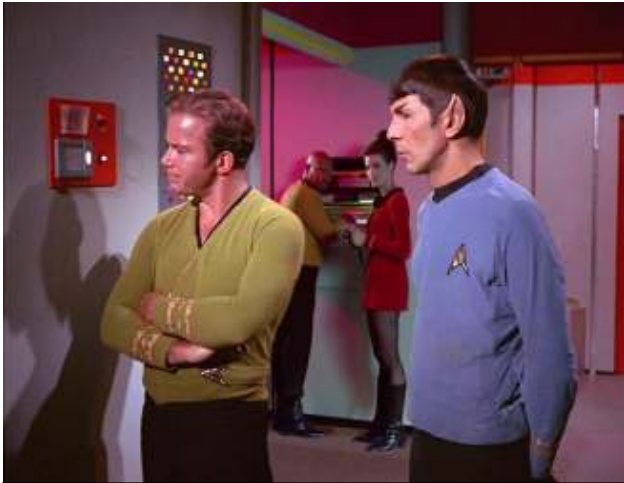
DS9: "Trials and Tribble-ations" TOS Captain Kirk and Commander Spock (William Shatner and Leonard Nimoy) are shown with DS9's Captain Sisko and Lt. Dax (Avery Brooks and Terry Farrell) http://images.wikia.com/memoryalpha/en/images/a/a1/Kirk%2C_Spock%2C_Sisko_and_Dax.jpg

Coincidentally (or not) the concept of using film footage from the past was featured in a Star Trek: Deep Space Nine episode entitled "Trials and Tribble-ations" that incorporated footage from The Original Series Star Trek "The Trouble with Tribbles." Using editing techniques perfected in the movie "Forrest Gump" the writers used scenes from the 1960's and placed them into context. The episode was broadcast for Star Trek's 30 th anniversary. Similarly, Son of the Defender uses footage of William Shatner in the 50's and inserts them into the episode as flashbacks. The episode airs as William Shatner and David E. Kelly celebrate recent birthdays.