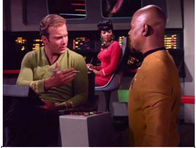
DS9: "Trials and Tribble-ations" Captain Kirk encounters Captain Benjamin Sisko (from the future) with Lt. Uhura (Nichelle Nicols) in the background on the bridge of the USS Enterprise. http://images.wikia.com/memoryalpha/en/images/6/66/Sisko_meets_Kirk.jpg