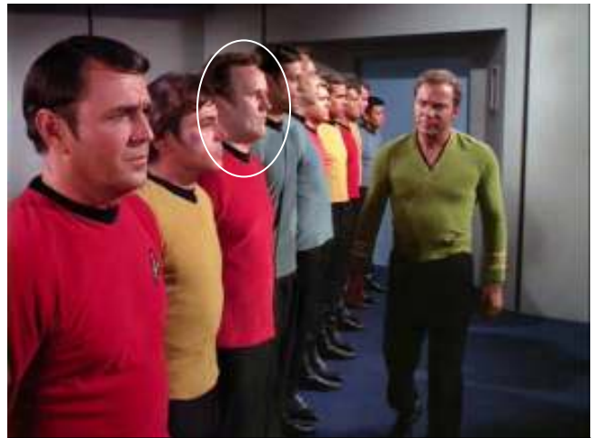
DS9: "Trials and Tribble-ations" The 3rd guy from the left is digitally replaced by DS9's Chief Miles O'Brien (Colm Meaney). Along with James Doohan, Chief Engineer Montgomery Scott "Scotty", (left ) Creating an encounter by two different generations of Engineers from the USS Enterprise.