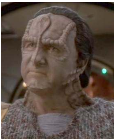
DS9: "Ties of Blood and Water" Lawrence Pressman as Tekeny Ghemor, a Cardassian Legate. http://images.wikia.com/memoryalpha/en/images/6/69/Tekeny-Ghemor.jpg