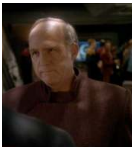
DS9: "The Adversary" Lawrence Pressman as Federation Ambassador Krajensky http://images.wikia.com/memoryalpha/en/images/3/3b/Krajensky.jpg