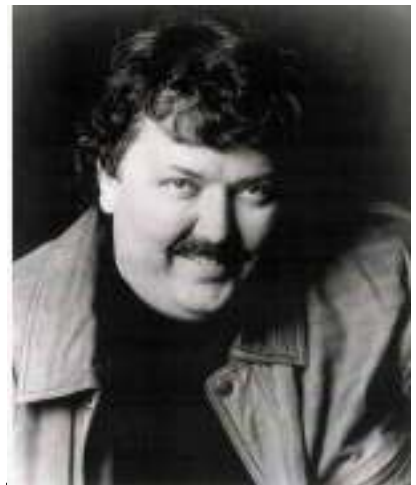
Michael G Hagerty publicity photo