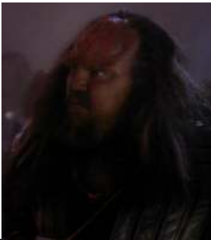
TNG: "Redemption II" Mike Hargerty as Captain Larg, Klingon Defense Force