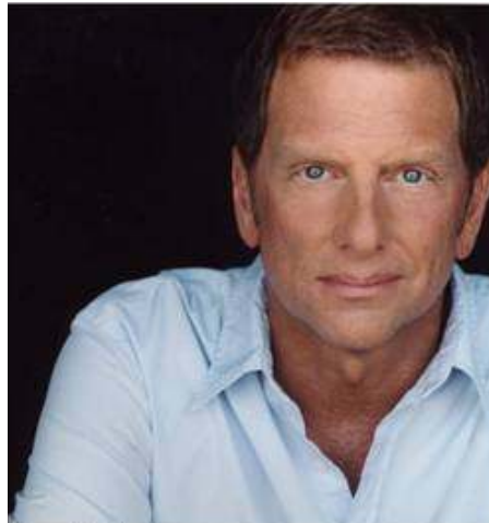
Scott Klace publicity photo http://imdb.com/gallery/hh/0458136/iid_1213586.jpg.html?path=pgallery&path_key=Klace.%20Scott&seq=4