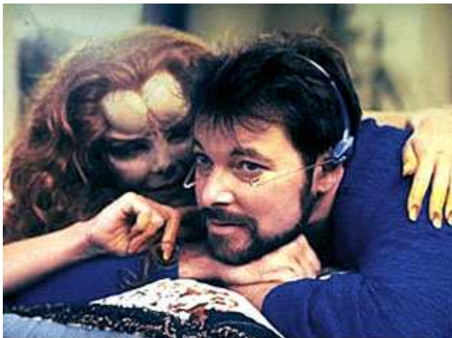
Etana Jol (a Ktarian) introduces Riker to "the game"

Theme 1: Wesley's Game In as much as TNG's Wesley Crusher (Stephanie Bellar's son's – whom she maintained was killed by the effects of the game - name was also Wesley ) was involved in uncovering the effects of a Ktarian virtual game, the effects which are described similarly in Word Salad. However, TNG's Wesley was the one attempting to prevent the crew of the Enterprise from a mind addicting game while the Boston Legal Wesley was the one to succumb to the negative and addicted effects of the game.