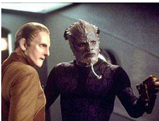
DS9: Odo (René Auberjonois) with a Jem'Hadar soldier

Interestingly, it was the character Odo as portrayed by René Auberjonois who becomes pivotal in this story arc.