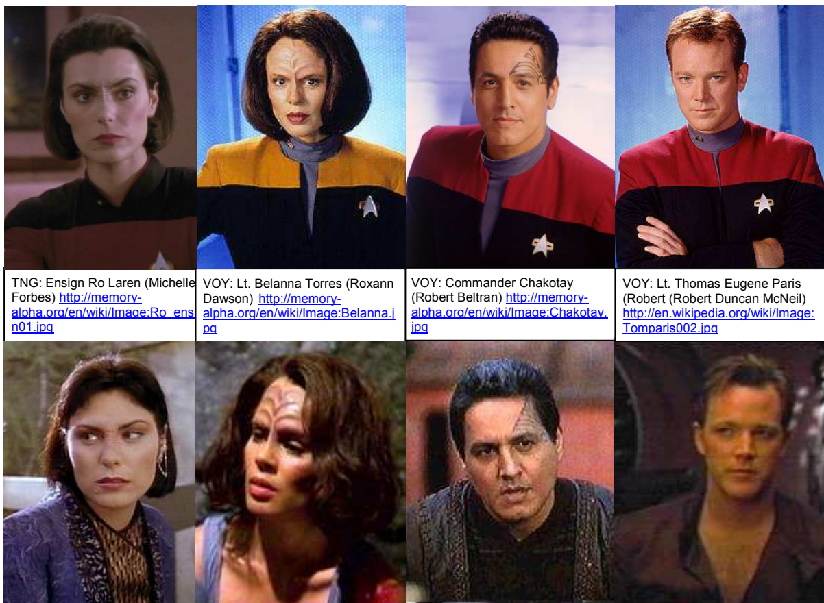
TNG: Ensign Ro Laren (Michelle Forbes) http://memory-alpha.org/en/wiki/Image:Ro_ensn01.jpg

The Maquis; A group consisting of former Bajoran freedom fighters, Starfleet sympathisers, and disenchanted individuals from all walks of life who either had personal grudges against the Cardassians, or simply were looking for a fight, band together to form The Maquis, who organized a guerrilla force to protect the homes of colonists abandoned by the Federation under treaty with the Cardassians who frequently attacked them in violation of the Treaty without any serious consequences.