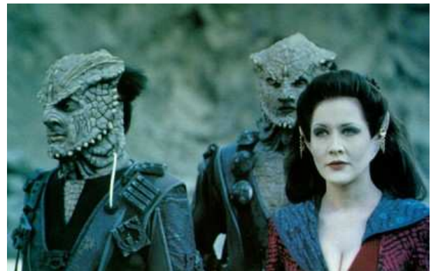
Two Jem'Hadar soldiers with a Vorta

Theme 3: The White Stuff: Not only is narcotic addiction explored in the several Star Trek series, Deep Space 9 dedicated an entire season of story arc to it and even had a race of drug addicted aliens called the Jem'Hadar (butt ugly too). This race of genetically engineered men (there are no Jem'Hadar women) have coded DNA that enhances their propensity towards violence. They were cultivated by the Dominion into "orcish" lifeforms, elite warriors with an overwhelming sense of devotion to the Founders whom they regarded as gods. Born within a birthing chamber, a Jem'Hadar infant will reach full adulthood within 3 days, ready to fight and addicted to "Ketracel White" or "the White" without which they would die. The "white" is administered by the Vorta, who control the Jem'Hadar via their addiction to the drug. www.geocities.com/area51/nebula/4156/infirmar/xeno/jemhadar.html