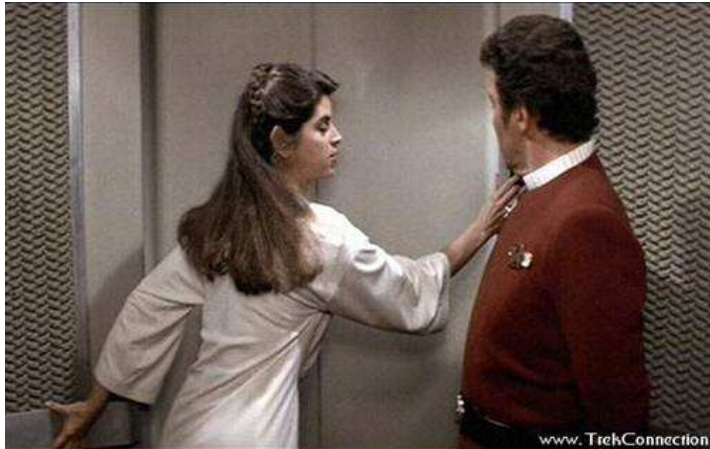
www.trekconnection.com/pictures/ST_2/page4.asp Star Trek: The Wrath of Khan movie: Lt. Saavik (Kirstie Alley) stops the turbolift in order to ask Admiral Kirk (William Shatner) a personal question.

Getting hung up in an elevator seems to be an occurrence exclusive to the 21 st century. Turbolifts (the futuristic equivalent of the elevator) has its moments throughout the Star Trek series.