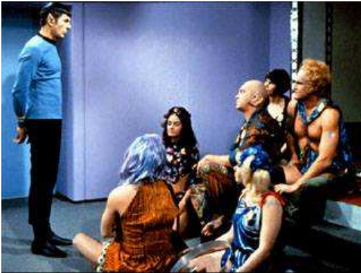
www.startrek.com "Hippies" invade the Enterprise in "This Way to Eden"

The 1960's and current times share a lot in common. Protests and demonstrations, anti-establishment culture and nudity was a way of life for some and way to draw attention to causes. The fashion icon was the mini skirt and Star Trek had its share of scantily clad women. Star Trek, TOS, dedicated two of its original episodes to the hippy movement – This Side of Paradise and The Way to Eden. Although the verbiage of the times was altered, the lingo meant the same. ie. Herbert was used to mean a “square” or someone representing the establishment by the “hippies”. “Make peace, not war” the slogan of the times.