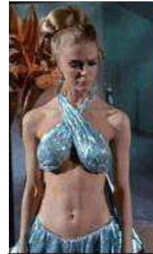
www.startrek.com Droxine (Diana Ewing), The Cloud Miners