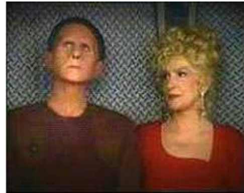
www.startrek.com Constable Odo (René Auberjonois) and Lwaxana Troi (Majel Barrett-Roddeberry) become confidants trapped in the turbolift in Star Trek DS9 "The Executive"