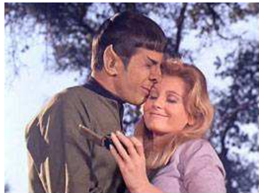
http://members.cox.net/stenterprise/enttm8a.htm Spock uninhibited and under the influence of Leila Kalomi (Jill Ireland) in This Side of Paradise

Clearly, Alan and Irma Levine represent the anti-establishment of our times (or the liberal left) and this episode had plenty of hippy moments including the topless protest but it was Alan calling Brad “square” that triggered this comparative.