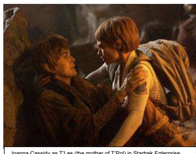
Joanna Cassidy as T'Les (the mother of T'Pol) in Startrek Enterprise www.startrek.com